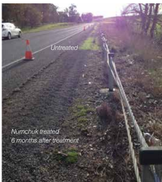
Peracto Trial: Sassafras, Tasmania, 2013-14